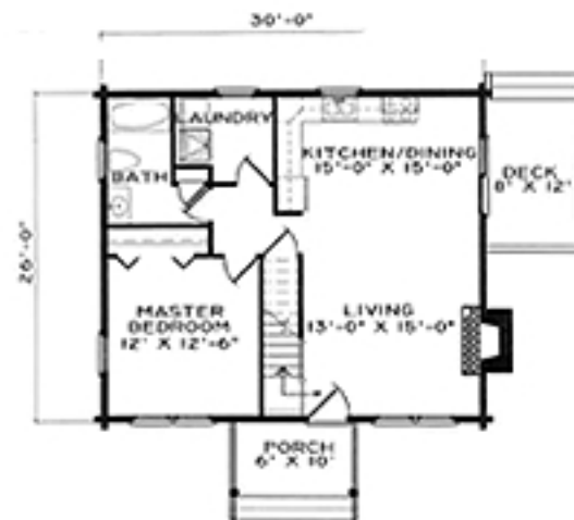
SUGGESTED 1ST FLOOR PLAN